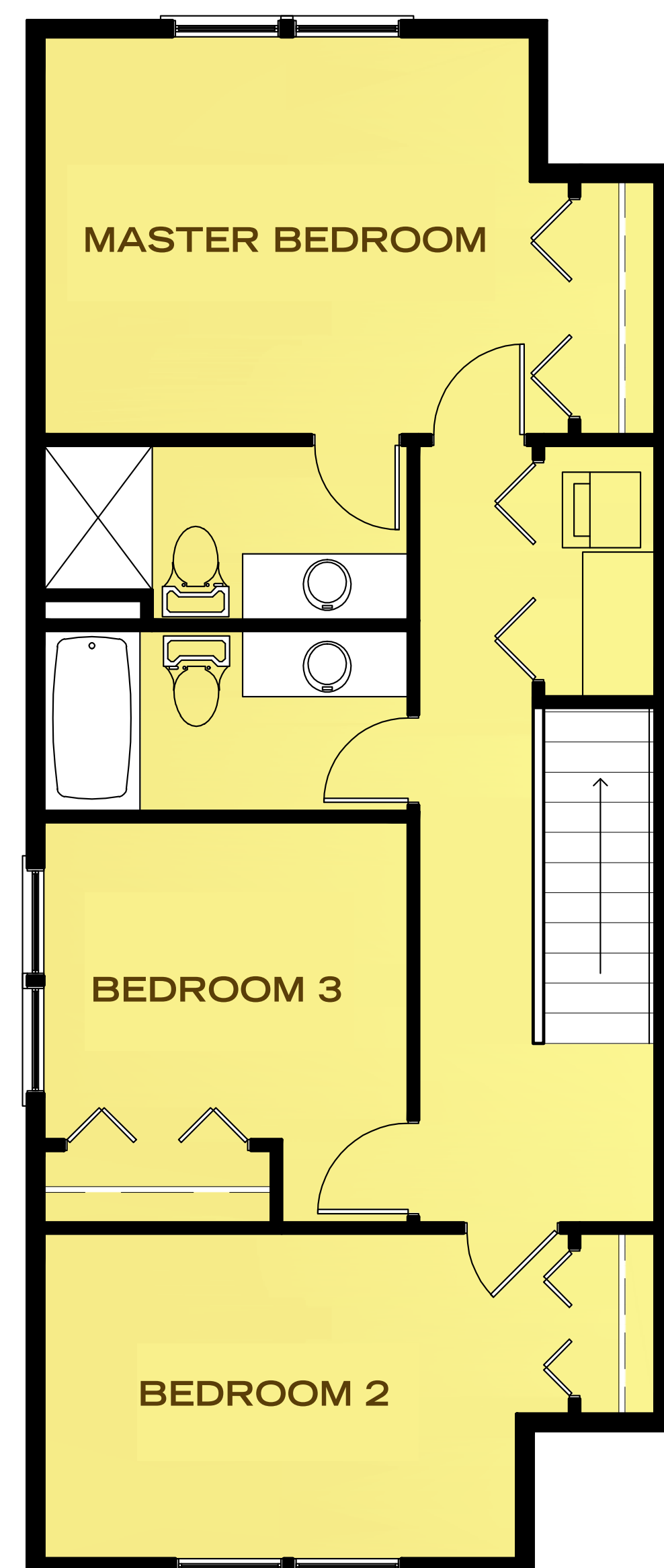
3RD FLOOR 709 SQ. Feet 2nd Floor